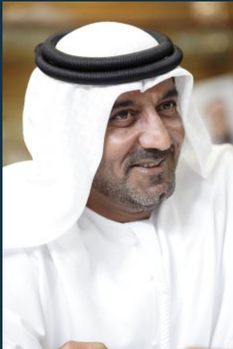
Sheikh Ahmed Bin Saeed Al Maktoum, Chairman of Dubai Airport Freezone