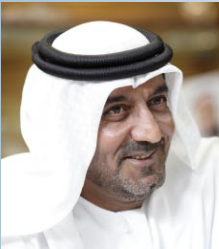
Sheikh Ahmed Bin Saeed Al Maktoum Chairman of Dubai Airport Freezone

In addition to the news about new companies setting up their regional offices, we welcome success stories within the Freezone community. Please send your contributions, suggestions, comments and inputs to newsletter@dafz.ae